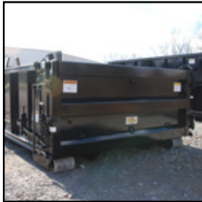
SEALED DUMP GATE

Options may result in increased cost and lead times.