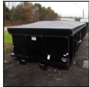
TARP (MANY STYLES AVAILABLE)