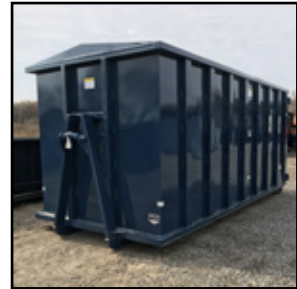
ROOF (MANY STYLES AVAILABLE)