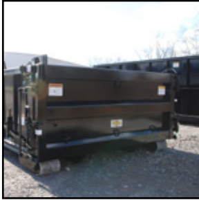
SEALED DUMP GATE

Options may result in increased cost and lead times.