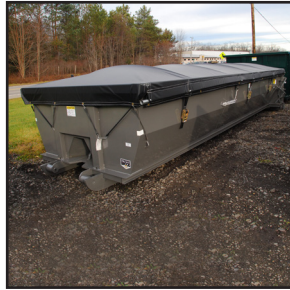
TARP (MANY STYLES AVAILABLE)