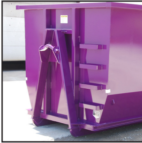
LADDER (ON FRONT)