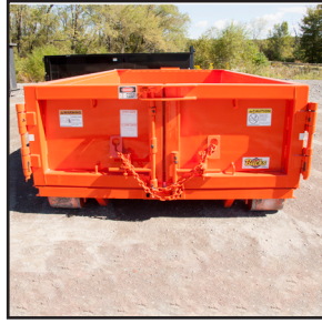
BARN DOOR GATE