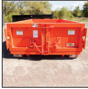
BARN DOOR GATE