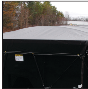
TARP (many styles available)